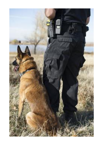
Remote K-9 IN CONTROL