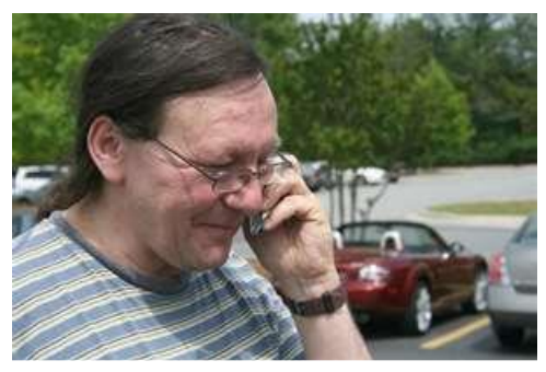
Covert Operations SECURE