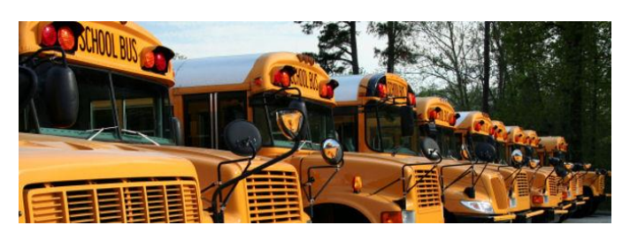
School districts CONNECTED